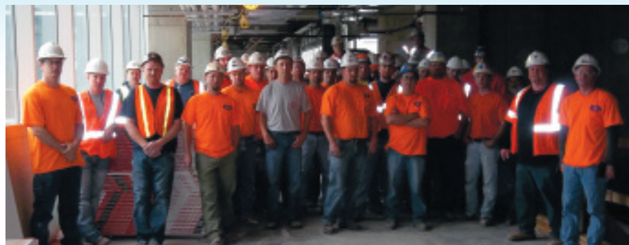
Local 257 members working with Meyer Electric on the Patient Tower building at the University of Missouri Medical Center gather at the job site.

Our annual picnic was Sept. 15 at Riverside Park in Jefferson City. We had a good turnout and enjoyed activities, barbeque and camaraderie. Congratulations