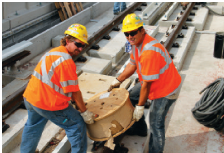
IBEW crews pulled miles of feeder cable to power the Silver Line's third rail.

The IBEW also participated in an on-the-job safety program—People Based Safety—which recruited observers from each craft to provide feedback to their co-workers, submit weekly reports