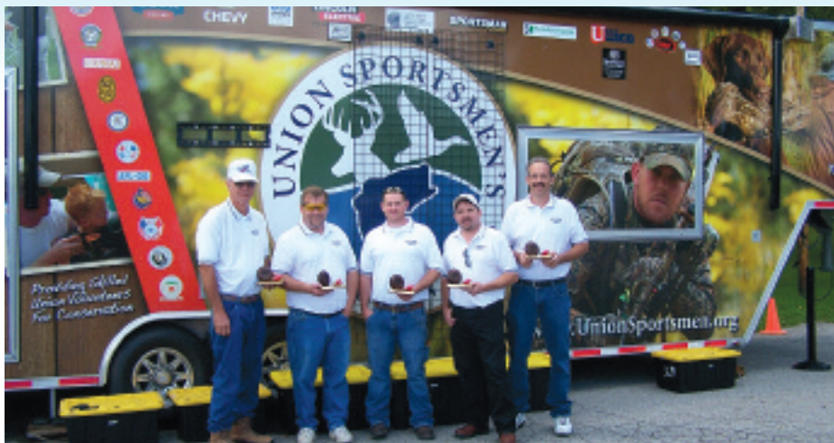
Local 153 team members took first place at a recent Union Sportsmen's Alliance Sporting Clay Shoot.