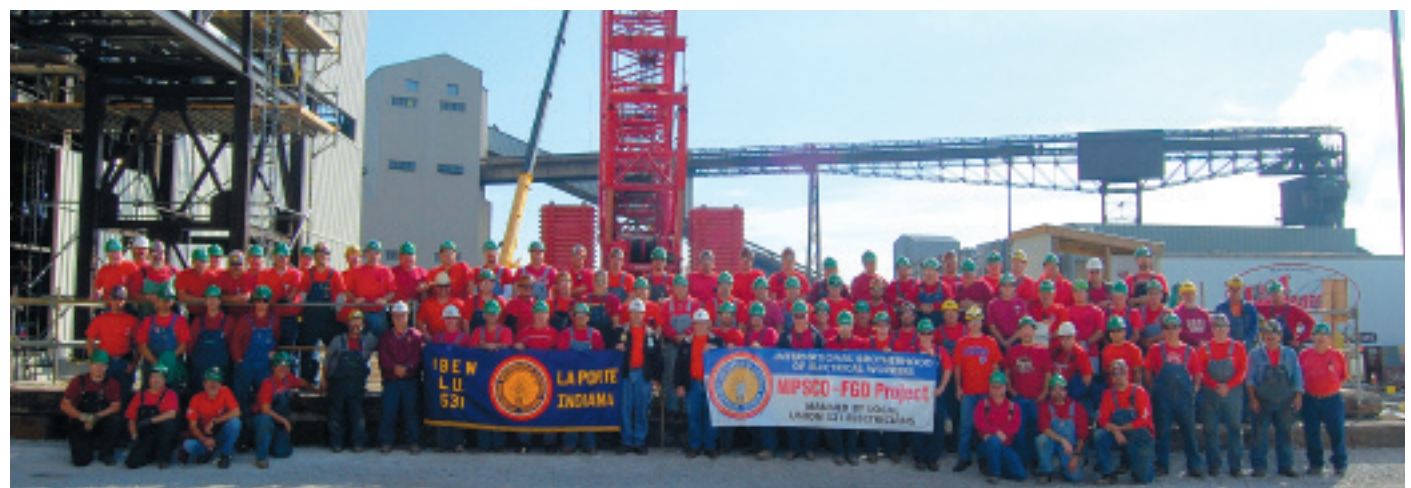
Local 531 members at NIPSCO R.M. Schahfer Generating Station.

L.U. 595 (c,govt,i&st), DUBLIN, CA—Greetings from the East Bay! Since Nov. 6, we have been celebrating the re-election of President Barack Obama, the defeat of the anti-union Prop 32 initiative, and the election of worker-friendly Democrats throughout