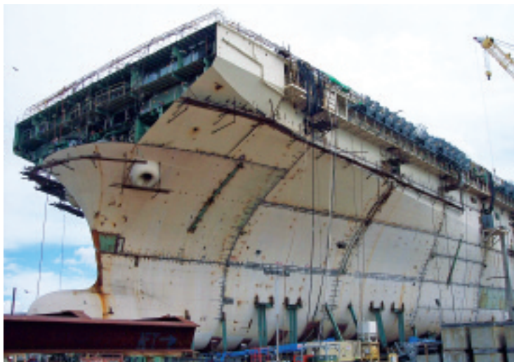
Amphibious assault ship USS America waiting for the final piece of the launch deck.

And to find out more about Fishing for Freedom, head over to www.FishingforFreedom.us . ■