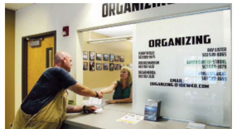
Forward-thinking tactics are helping Portland, Ore., Local 48 leaders grow the membership, adding 150 new electricians over the last year and a half.

“That really was more of a message to our members and to the exterior world that organizing is right up there with dispatching in importance—and we’re very