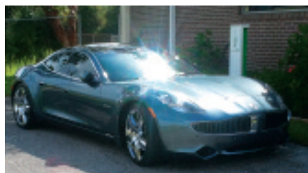
Local 915 Tampa JATC unveils new electric car charging station.