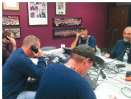
Local 9 volunteers staff election season phone banks.