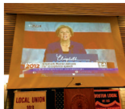
U.S. Sen.-elect Elizabeth Warren delivers acceptance speech.

On Election Day, we were proud to have Local 103 as ground zero where over a thousand volunteers showed up on Monday, Nov. 5, and on Election Day to help get out the vote, operate phone banks and distribute literature. At 10 p.m. on elec-