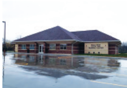
Local 649 Training Center, with reflection on pavement after a rain shower.